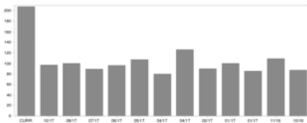
12-MONTH WATER USAGE (USAGE LISTED IN THE THOUSANDS OF GALLONS)

For more information on usage, please visit the following city webpage: http://www.villageofpalm Springs.org/index.aspx?nid=339